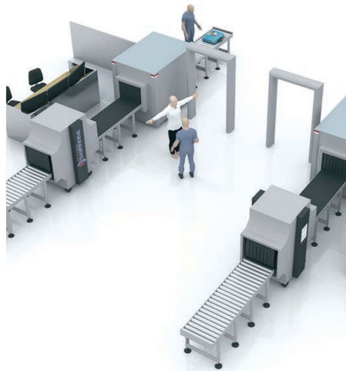
Integrated baggage handling protection solution

Dynasafe has extensive experience in the design and operation of explosion protection and related security systems. By discussing the client's needs at an early stage Dynasafe is able to provide the optimum solution for maximum protection, to an existing, adapted or entirely new solution.