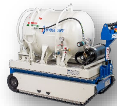
Mounted on Drive Unit